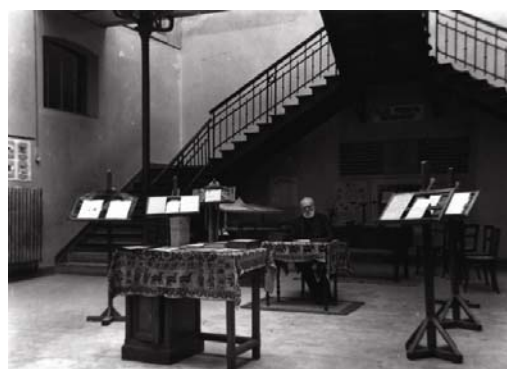
Fig. 3: Photograph of Otlet before the staircase in the municipal school in the Rue Fétis.

The visionary or utopian dimension of Otlet's monumental oeuvre has also been emphasized in the last decade by different journalists, exhibition makers, and authors. In an article in Le Monde Magazine , in 2009, the journalist Jean-Michel Dijan calls Otlet and his colleague Henri La Fontaine "two utopians/lawyers" who "have devoted their life to a mad enterprise: to assemble and to make accessible to everyone all the knowledge of the world" 10 . Like Dijan, the journalist Alex Wright mythologized Otlet in The New York Times , in 2008, in contemporary terms as the forgotten forefather of the World Wide Web 11 .