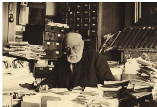
Fig. 2: Photograph of Otlet at his desk in his house in the Rue Fétis.