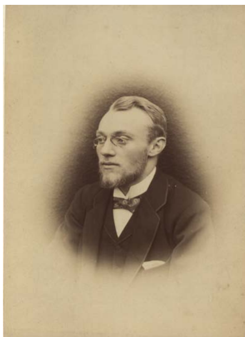
Fig. 1: Portrait of Paul Otlet in his late twenties.

According to Maus, he was a man of cordial character, with a multiplicity of tastes and an independent mind, a mind that had absorbed the complexity of the intellectual culture of his time. As Maus observed, "his intimates cannot imagine otherwise, when they think of him, than as the image of a man surrounded by cards, boxes, files that he juggles with the agility of a slight-of-hand artist" 2 . By "the ardour of his faith and the firmness of his convictions" 3 , he pursued the dream and the ambition to "inventory human thought, to establish a registry of thirty or forty million works scattered in all the libraries of the globe, and then to keep this colossal enterprise up to date, to make the work permanent" 4 . This was the Universal Bibliographic Repertory (Répertoire Bibliographique Universel , often referred to as the RBU ), a project that he developed in collaboration with the lawyer, freemason, and socialist Henri La Fontaine (1854-1943). In addition to his bibliographical enterprise to inventory all publications, as described by Maus, Otlet's work is a milestone in the history of information science in that he formulated the concept of "documentation", a